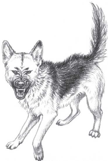
Drawing 1. Offensively threatening dog

Offensively threatening dogs try to make themselves look bigger and more menacing.