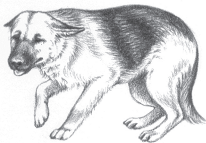
Drawing 2. Fearful dog

Fearful or submissive dogs try to make themselves look smaller and less menacing.