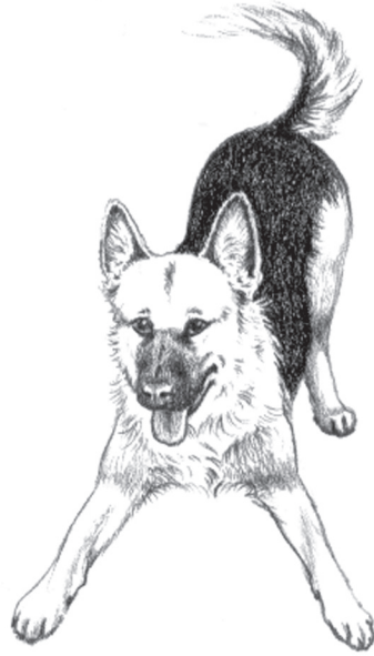
Drawing 4. Playful dog

Play shows a mixture of many different behaviors.